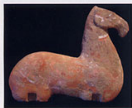
Han dynasty horse Shangxi Province, China Bosshard Furnishings & Ethnographica