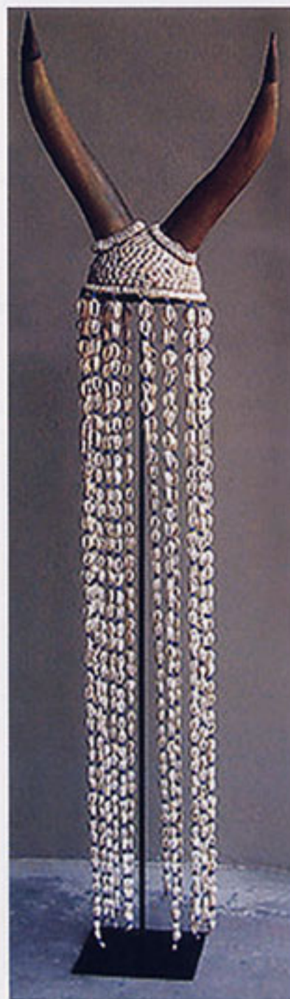
Losa horned headdress Casa Nova

inspired by the elegance of the physical universe — and explores the meeting of art and science. Artists represented include John Dodero, Dan Fogelberg, Mike Holberg, Carol Kucera, Sarah Kucerova, Richard Rozinski, Catherine Tempelman and Dierk Van Keppel.